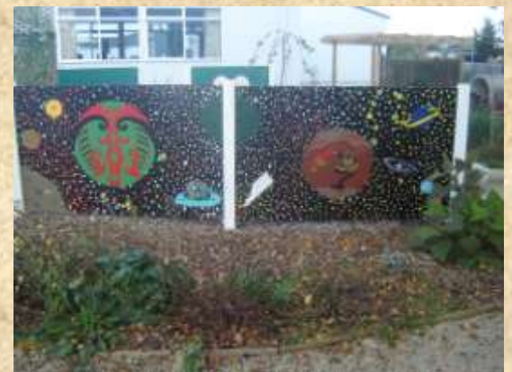
New Projects for 2009