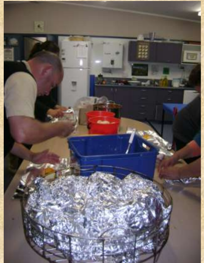
Hangi / Catering