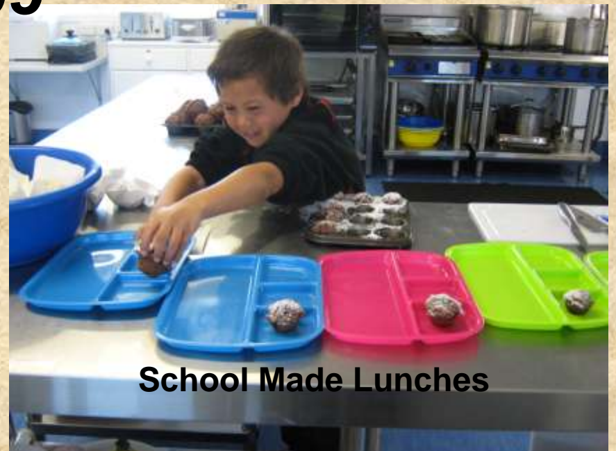
School Made Lunches