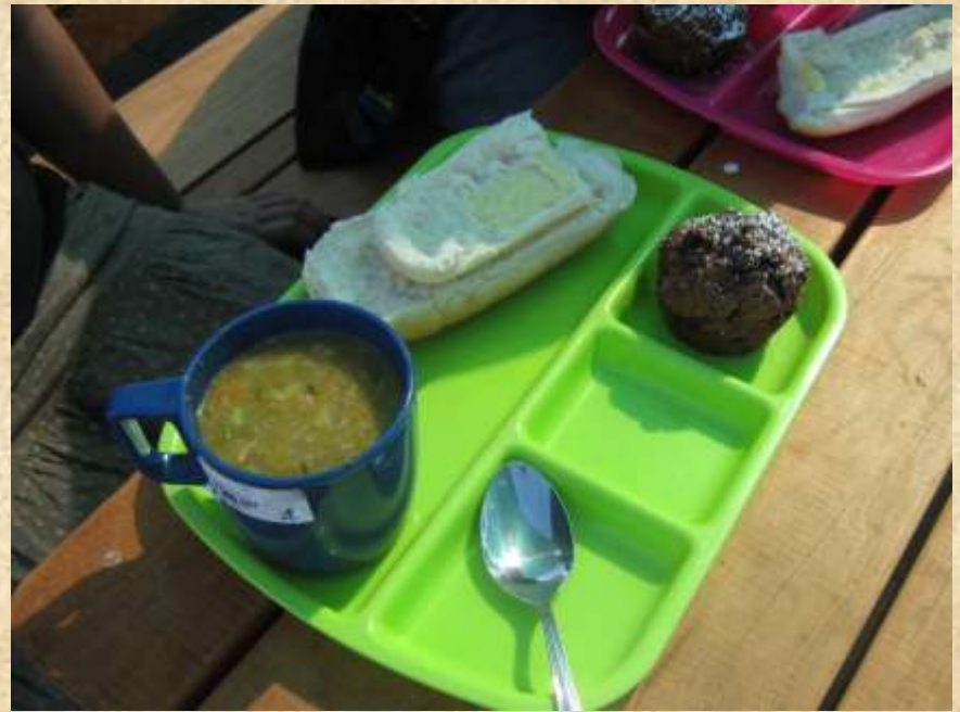
School Made Lunches