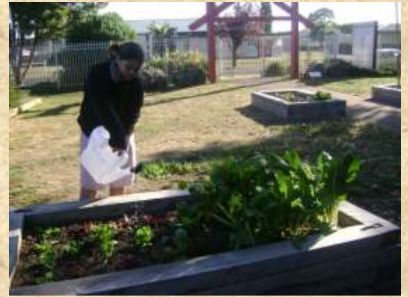
Planting – Nurturing - Harvesting