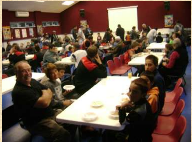
Good Fellows Breakfast