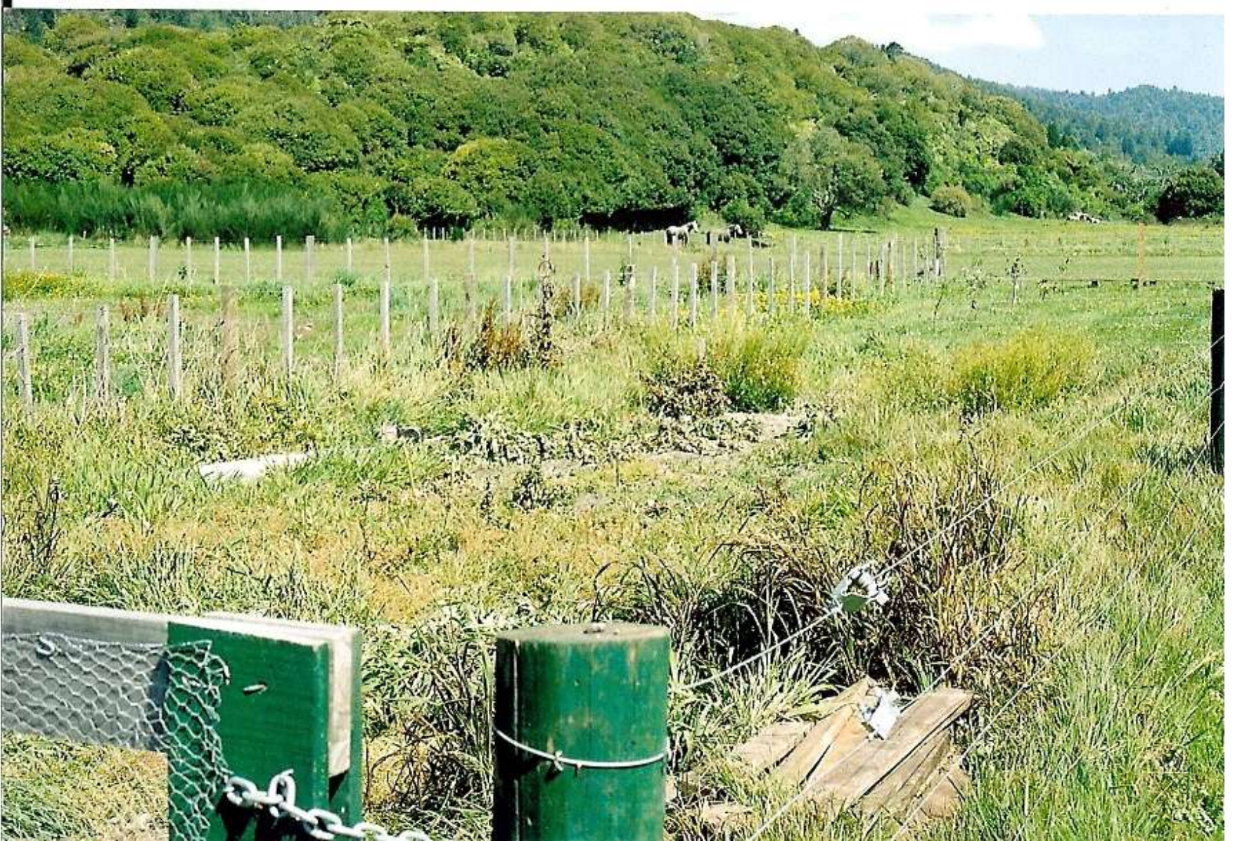
Te Wharekura o Ruatoki –under used garden space