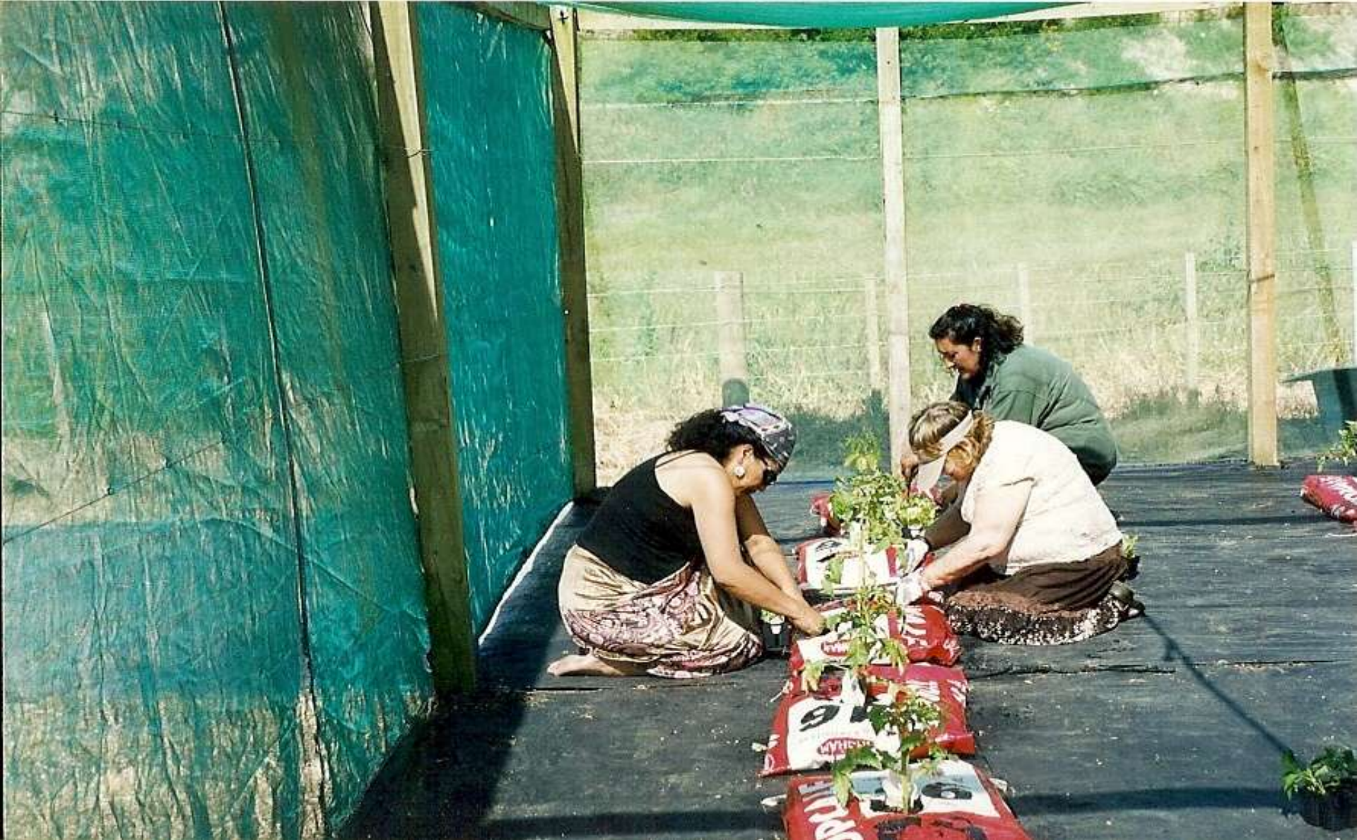
Laying out the grow bags and planting