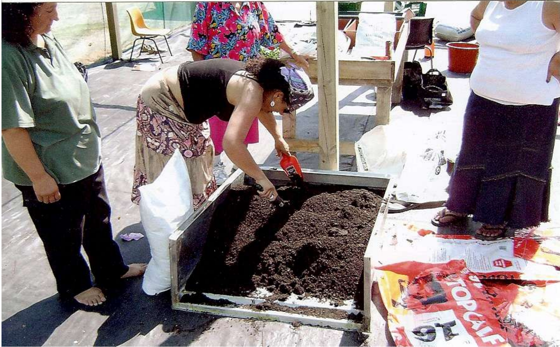
Cuisine participants filling innovative plant grow bags